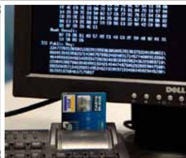
Extraction of cryptographic data from a credit card