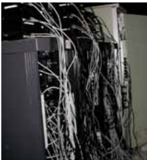
Computational grid - connections