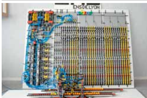
Lego Turing Machine – student project