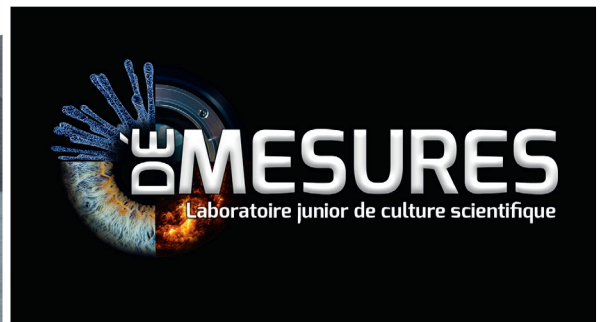
Junior laboratory from 2015 to 2017, an association since 2018