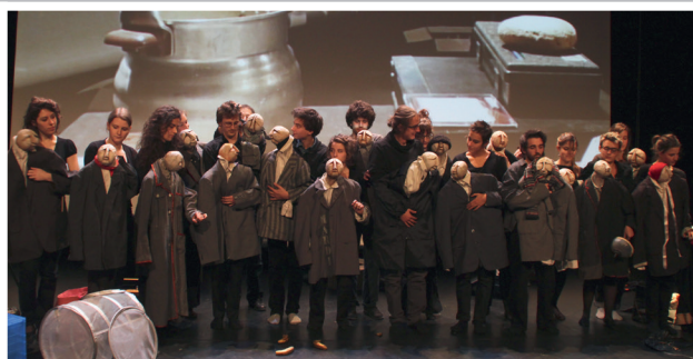
Master class Literature and The Arts – 2011