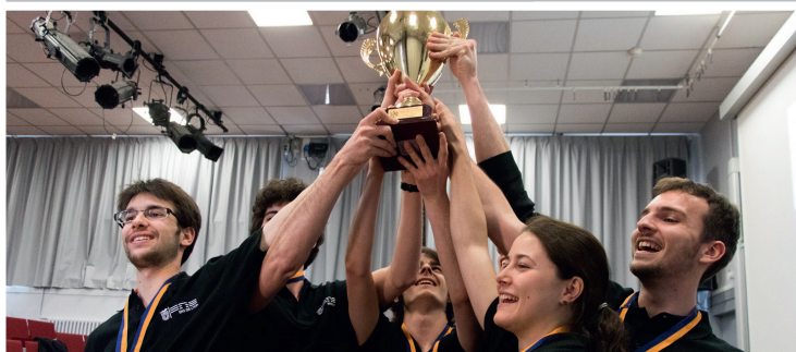
French Physicists' Tournament – 2016

The term “normalien” or ENS student applies to all students enrolled in the diploma, ENS pupil with civil servant status student for those admitted on the basis of the competitive entrance exam, and ENS student for those admitted on the basis of student records.