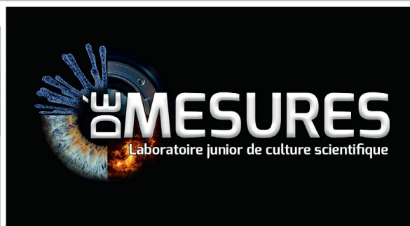
Junior laboratory from 2015 to 2017, an association since 2018