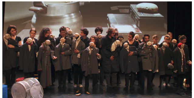
Master class Literature and The Arts – 2011