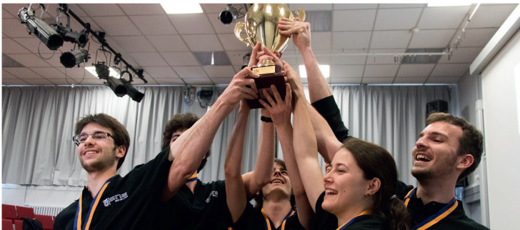
French Physicists' Tournament – 2016

The term “normalien” or ENS student applies to all students enrolled in the diploma, ENS pupil with civil servant status student for those admitted on the basis of the competitive entrance exam, and ENS student for those admitted on the basis of student records.