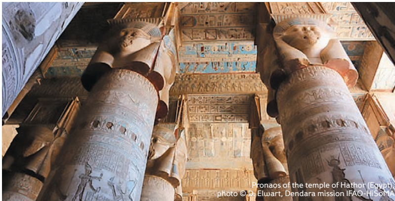
Pronaos of the temple of Hathor (Egypt)