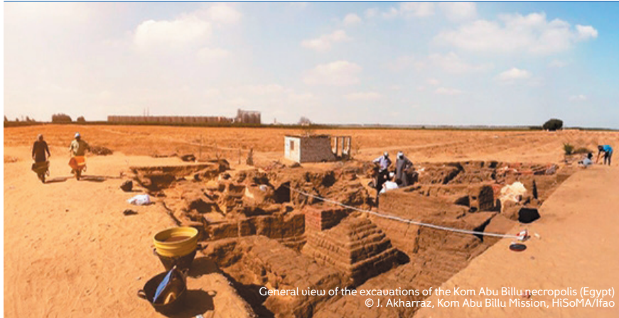
General view of the excavations of the Kom Abu Billu necropolis (Egypt)