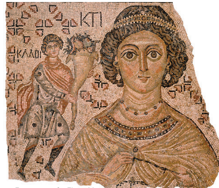
Fragment of a Floor Mosaic with a personification of Ktisis (Metropolitan Museum of Art, NY, 6th century)