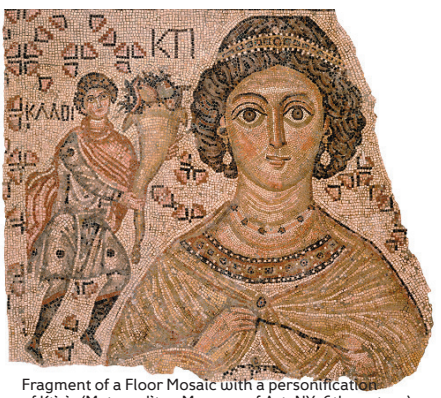
Fragment of a Floor Mosaic with a personification of Ktisis (Metropolitan Museum of Art, NY, 6th century)